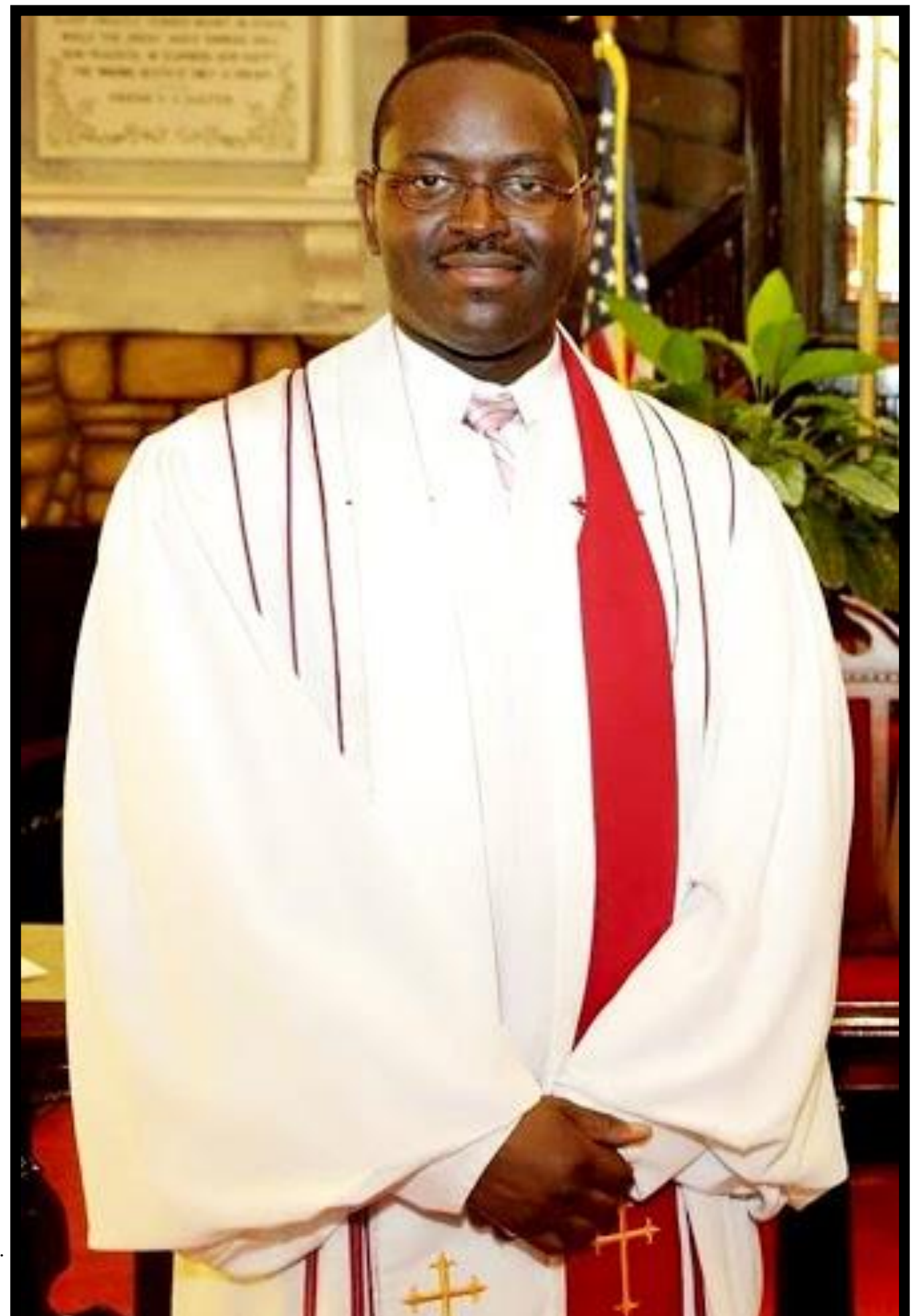
The Honorable Reverend Clementa Carlos Pinckney