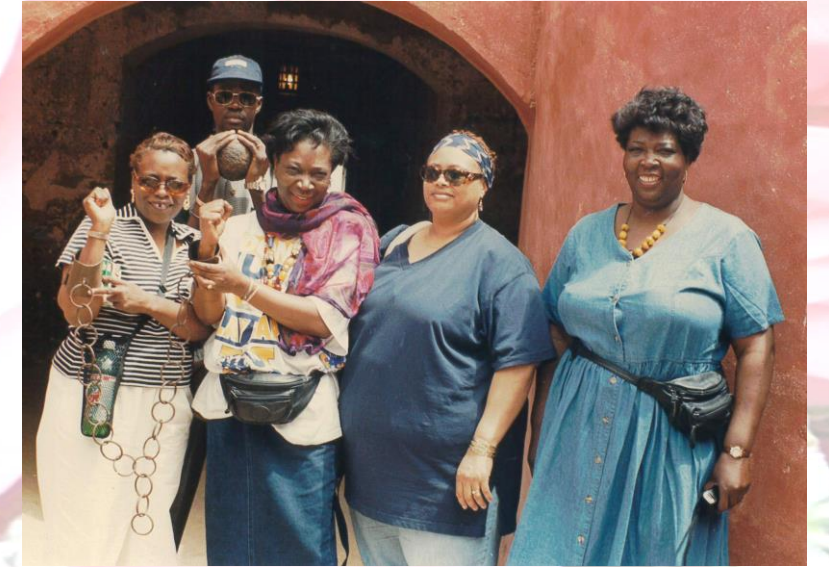
Goree Island, Senegal West Africa