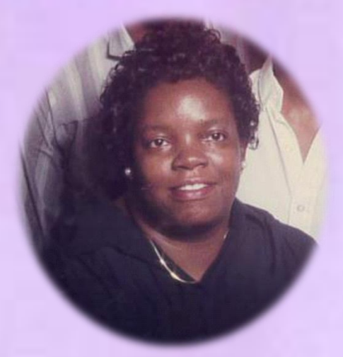
Family and Friends

Trust in the Lord with all your heart and lean not on your own understanding; in all your ways submit to him and he will make your paths straight. Proverbs 3:5