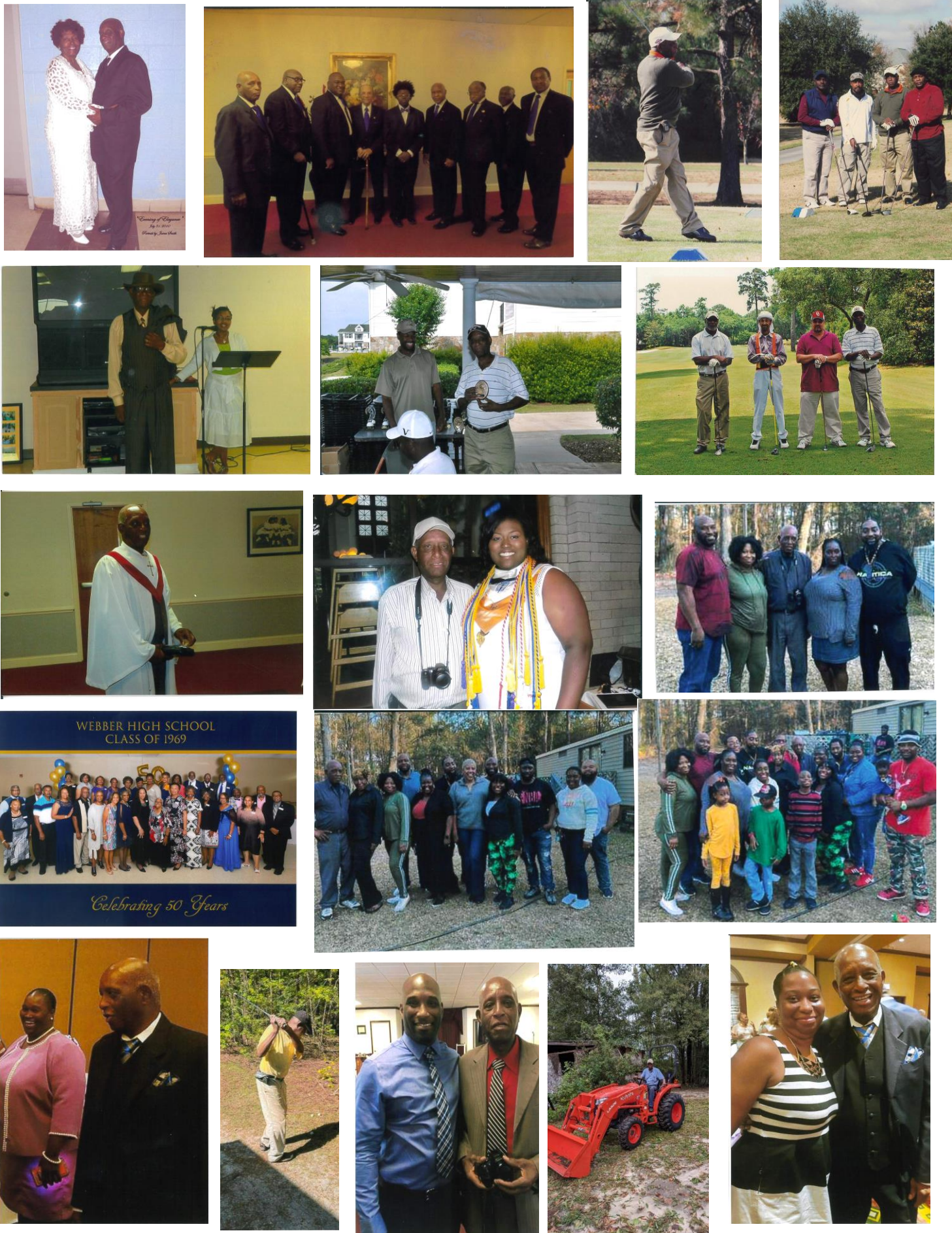
WEBBER HIGH SCHOOL CLASS OF 1969 Celebrating 50 Years