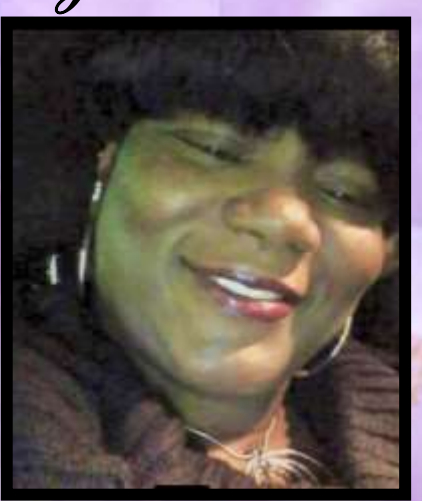
Saturday, July 15, 2023 1:00 p.m.

Second Calvary Baptist Church 1110 Mason Road Columbia, South Carolina