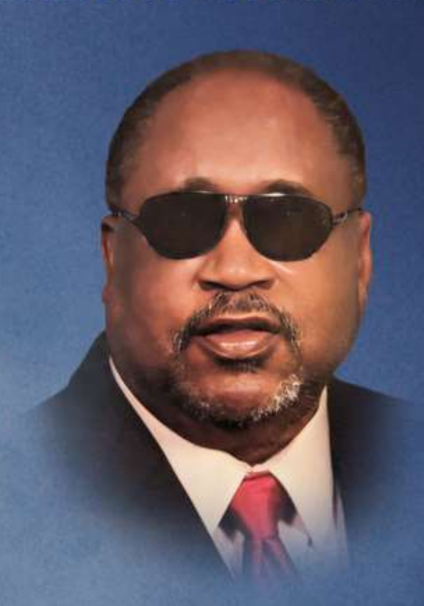
TUESDAY, FEBRUARY 6, 2024 11:00 A.M.

St. Mark United Methodist Church 8502 North Road North, South Carolina